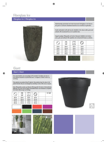
Example of typical page from our Products brochure.

We specialize in submitting proposals within your design and Green Star point requirements.